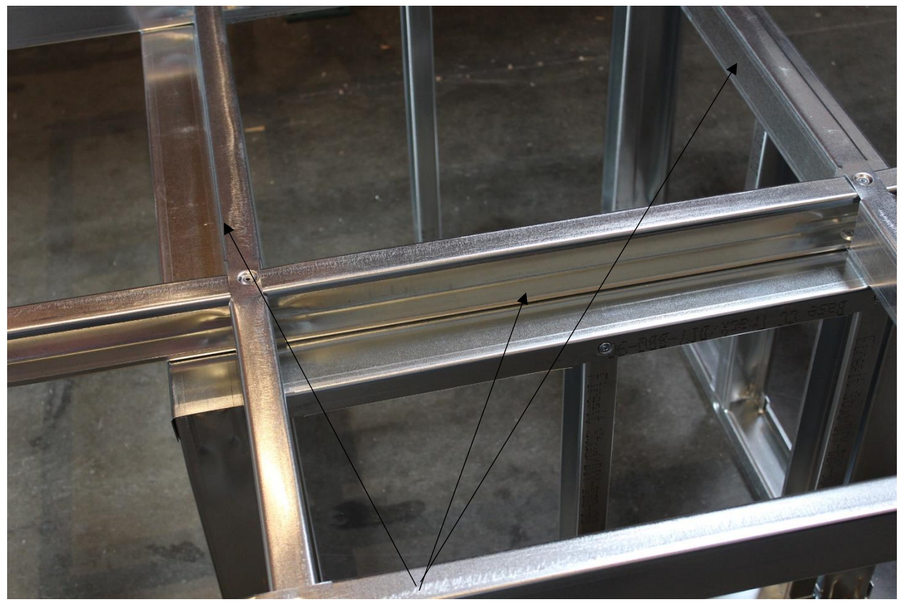
Place the top onto the base and screw from the rails of the top into the base to hold the top on. Place approx. 3 screws on each side.